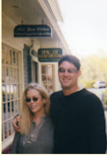
Kennebunkport, Maine, 2004

And do not have fellowship with the unfruitful works of darkness; instead, expose them.